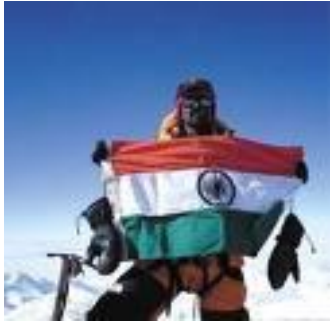
Malli Mastan Babu , The incredible feat of scaling the highest peaks of the seven continents in 172 days, the fastest so far, will inspire millions of our youth